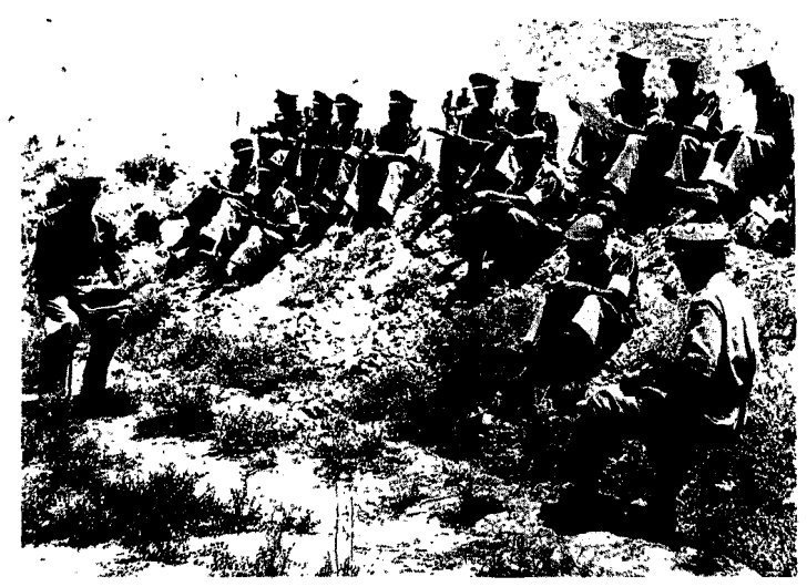
Embassy of Pakistan Junior officers participating in a tactical discussion at the Infantry School, Quetta